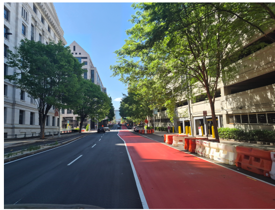
Example: No driving or parking in solid red bus-only lane